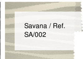
Savana / Ref. SA/002