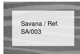
Savana / Ref. SA/003