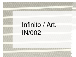
Infinito / Art. IN/002