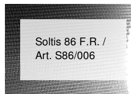
Soltis 86 F.R. / Art. S86/006