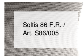
Soltis 86 F.R. / Art. S86/005