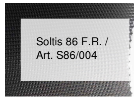
Soltis 86 F.R. / Art. S86/004