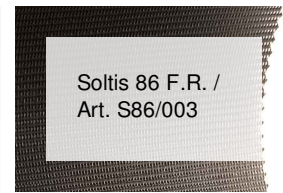
Soltis 86 F.R. / Art. S86/003