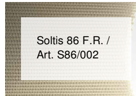
Soltis 86 F.R. / Art. S86/002