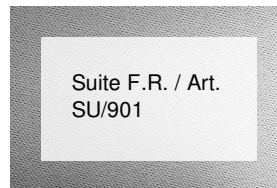
Suite F.R. / Art. SU/901