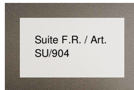
Suite F.R. / Art. SU/904