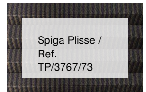
Spiga Plisse / Ref. TP/3767/73