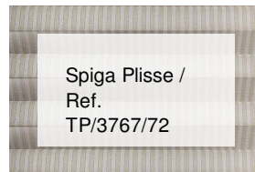
Spiga Plisse / Ref. TP/3767/72