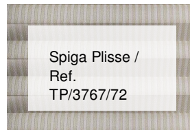
Spiga Plisse / Ref. TP/3767/72